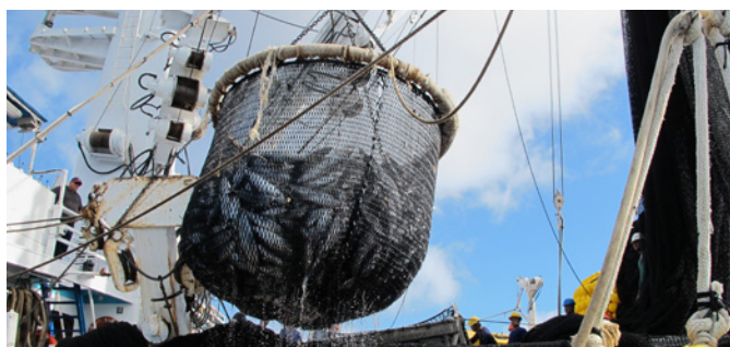
ISSF (2012)/Photo: David Itano